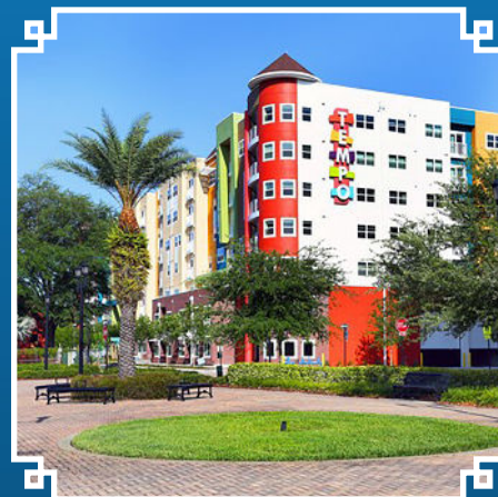
The Tempo at Encore, Tampa Housing Authority

Public Housing Agencies (PHAs) use the Rental Assistance Demonstration (RAD) Program to preserve affordable housing and improve properties by "converting" their form of federal assistance to the Section 8 program. PHAs choose to convert to either: Section 8 project-based voucher (PBV) or Section 8 project-based rental assistance (PBRA).