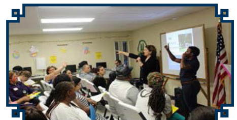
Residents should ask about any impacts converting to Section 8 may have on their rent, repairs that might be done on the property, and whether residents will need to be relocated temporarily.

PHA Plan. Note that in addition to meeting with residents of the converting project, a PHA must also amend its PHA Plan to reflect the proposed RAD conversion and solicit community input. As part of this process, a PHA will hold separate public meetings and collect comments.